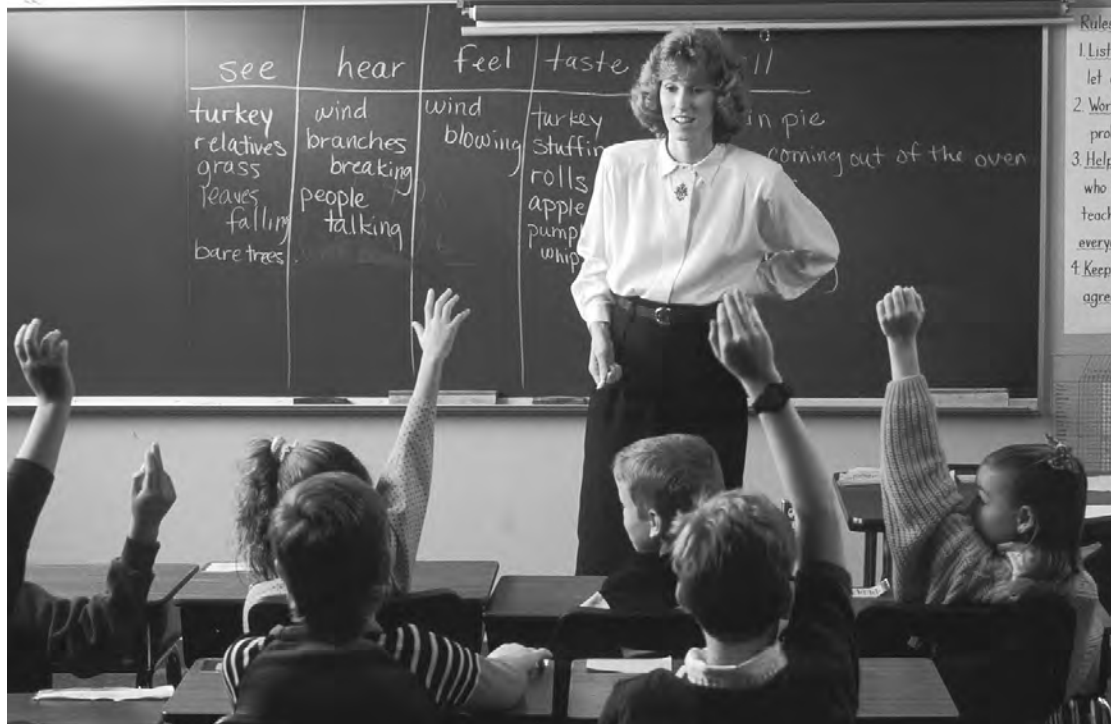
Traumatized children benefit from classrooms that they know are physically and psychologically safe and secure.

cause harm. Supports need to be in place in every classroom to address behavior that is out of control or unsafe. (See section VI-A of the Framework, “Discipline Policies.”) Children’s sense of safety will be increased by incorporating functional safety skills into the regular curriculum, teaching conflict-resolution skills, and seeing teachers resolve conflict in appropriate ways.